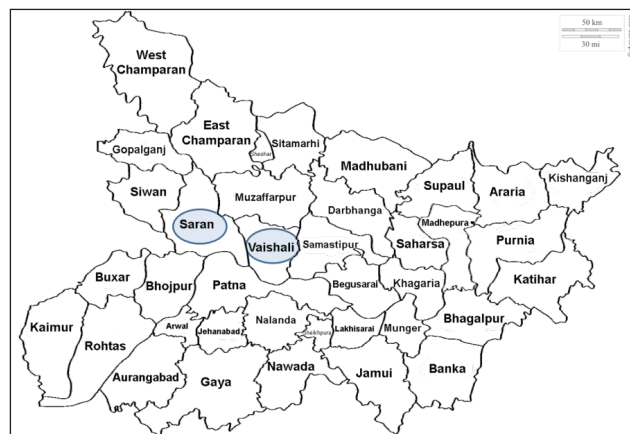
Fig. 1. Map showing the study areas

This study was conducted in Vaishali and Saran districts of Bihar (Fig. 1). Both these districts are selected purposively since these were two top potato producing districts of North West regions (Agro climatic Zone I) of Bihar. Three blocks in each district (total six blocks) and 15 potato growers from each block were selected for data collection. Thus, the total sample size for this study was 90 farmers. Primary data was collected through survey method using a structured interview schedule and analyzed using suitable statistical tools. Secondary data was also collected from already published articles for data on area, production and productivity as well as yield data for demonstration yield and potential yield of a variety.