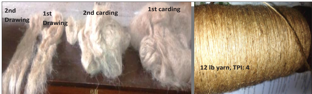
Fig. 3: TPI: 4; Count: 12 lbs/spy; Gauge length = 500 mm; Speed = 300 mm/min