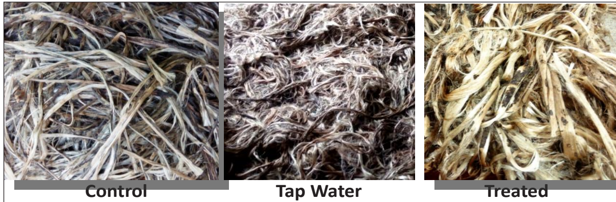
Fig. 2: Photographs of the control and treated barky root cuttings

An up-scaling of the treatment was carried out with 25 kg root cuttings. Here bacterial consortium was reduced and liquor ratio was increased to 1:15 with the same objective to increase spinnability keeping