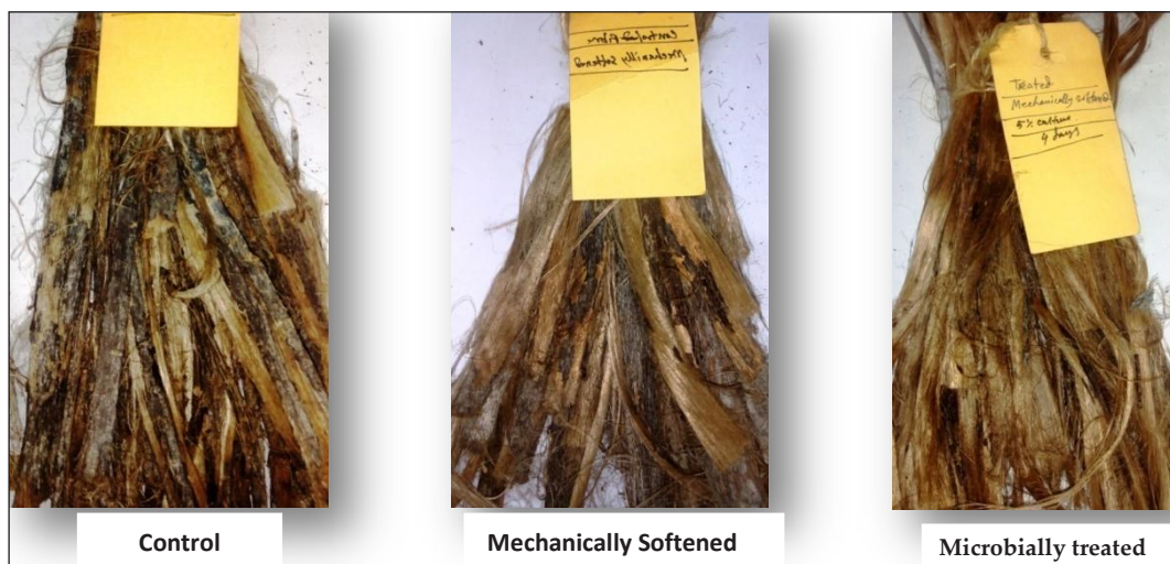
Fig. 4: Treated and untreated fibres with the formulations

mixing/batching with TD-4 grade jute fibre with a 50:50 ratio which enhanced quality ratio from 46.6 (100% treated fibre) to 68.9 (50:50 ratio) (Table 6 & 7, Fig. 4 & 5).