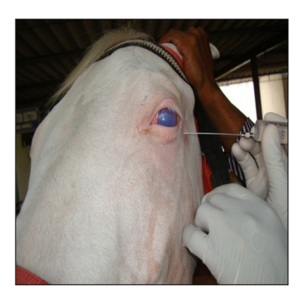
Fig. 2: Retrobulbar nerve block in a horse