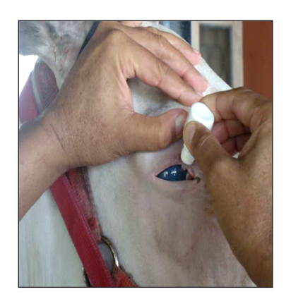
Fig. 3: Instillation of proparacain for corneal desensitization