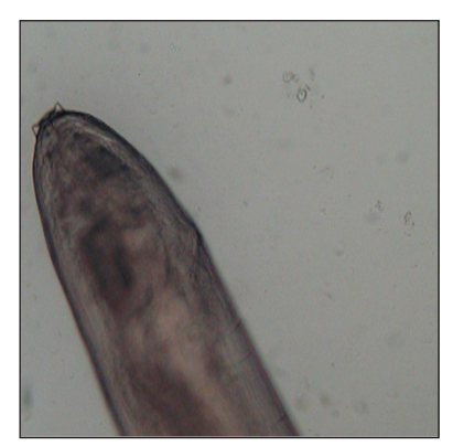
Fig. 7: Gross Photograph of the parasite Fig. 8: Microscopic photographs showing Fig. 9: 2-3 week follow-up photographs removed from the eye