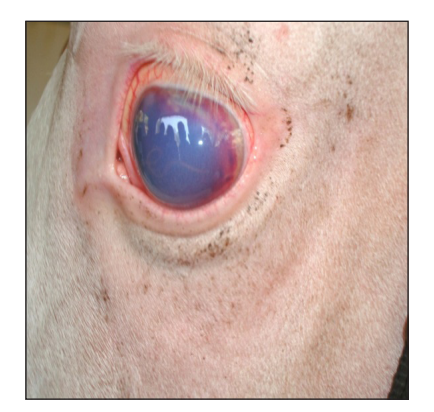
Fig. 1: Worm in the eye before surgery