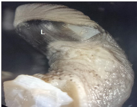
Fig. 6: Photograph showing the Lingual nail (L) of the tongue of macaw (ventral view).