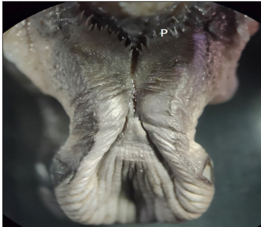
Fig. 4: Photograph showing the conical papillae (P) on the tongue of macaw (Dorsal View)