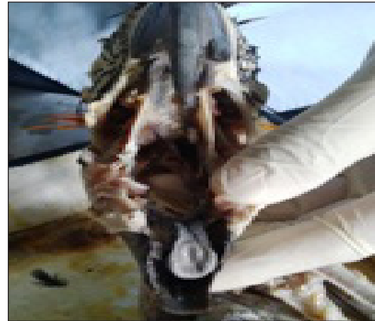
Fig. 5: Photograph showing the mouth cavity of macaw