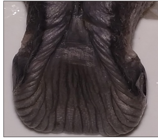
Fig. 3: Photograph showing the grooves on the dorsum of the tongue of macaw (Dorsal View)