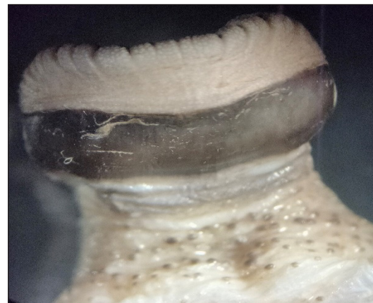
Fig. 7: Photograph showing the Lingual nail of the tongue of macaw (ventral view)