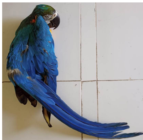
Fig. 1: Blue Gold Macaw

found on the postero-lateral aspect on either side. The conical papillae were observed at the posterior aspect of the lingual body. The fungiform papillae were ill developed. The tongue was connected by frenum linguae with the floor of mouth. The depression was present on the middle of dorsum of tongue. The lingual nail was found on the ventral surface below the tip of the tongue which was formed by strong and hard keratinized epithelium (Fig. 4,6&7). The lingual nail is flexible enough that it can be stretched. In some birds, it may be used as a spoon for lifting grains (Emura et al. , 2012; Emura 2016).