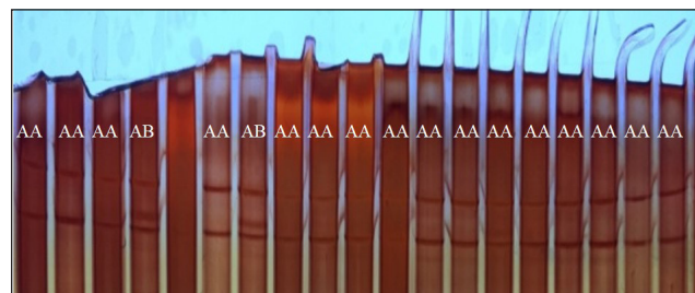
Fig. 2: PAGE displaying SSCP patterns of BMP4 gene promoter in broiler and layer

The study revealed the presence of polymorphism in the fragments of both broiler and layer chicken lines (Fig. 2) with AA genotype being predominant one having frequency of >80% over other two genotypes (AB and AC with combined frequency of <13%).