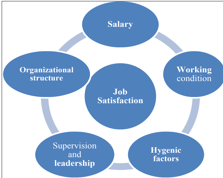
Fig. 2: Factors Affecting Job Satisfaction

Following factors which affects the Job Satisfaction are as follows: