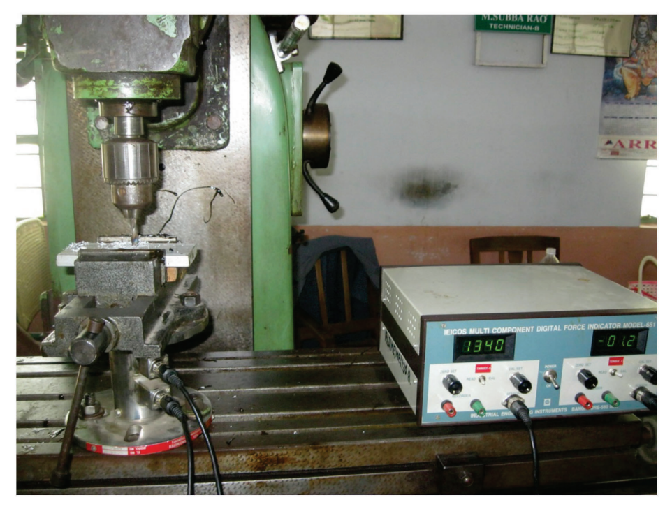
Fig. 1: Experimental Setup

The standard high- speed steel twist drills of 8mm, 10mm and 12mm with different point angles(118°,126° and 136°) ,variable cutting fluid mixture ratio[ (120ml of soluble oil + 880ml of water), (180ml of soluble oil + 820ml of water), (240ml of soluble oil + 760ml of water)]was used with variable speeds and feed rates for the present investigation. Drilling operation was carried out on a Universal Milling Machine with vertical head attachment, Sutlej make, Ludhiana, Punjab, India. Sensing signaled (thrust force (0-5000N) and torque (0-500Nm) were measured using drill tool dynamometer (IEIOS Bangalore make, Model: 651). Drilling of exercises was carried out for each experimental condition to drill 10mm depth blind holes on the Aluminum 6061alloy having the composition of 0.63% Si, o.466% Fe, 0.096% Cu, 0.179% Mn, 0.53% Mg,0.091% Zn, 0.028% Cr,0.028% Ti and remaining aluminum and for each experimental condition five holes were drilled.