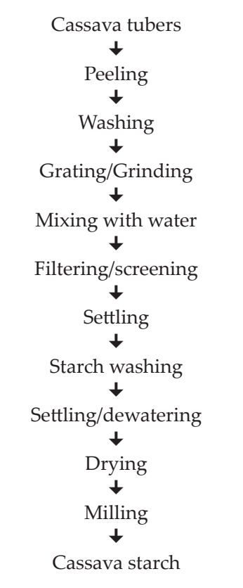
Fig. 1: Extraction of starch from cassava tubers

Fresh tubers were washed, peeled, chopped into approximately 1 cm cubes and then ground in a high speed blender for 5 min (Fig. 1.). The pulp was suspended in ten times its volume of water, stirred for 5 minutes and filtered using double fold cheese cloth. The filtrate was allowed to stand for 2 hr for the starch to settle and the top liquid was decanted and discarded. Water was added to the sediment and the mixture was stirred again for 5 minutes. Filtration was repeated as before and the starch from filtrate was allowed to settle. After decanting the top liquid, the sediment (starch) was dried at 55°C for one hour.