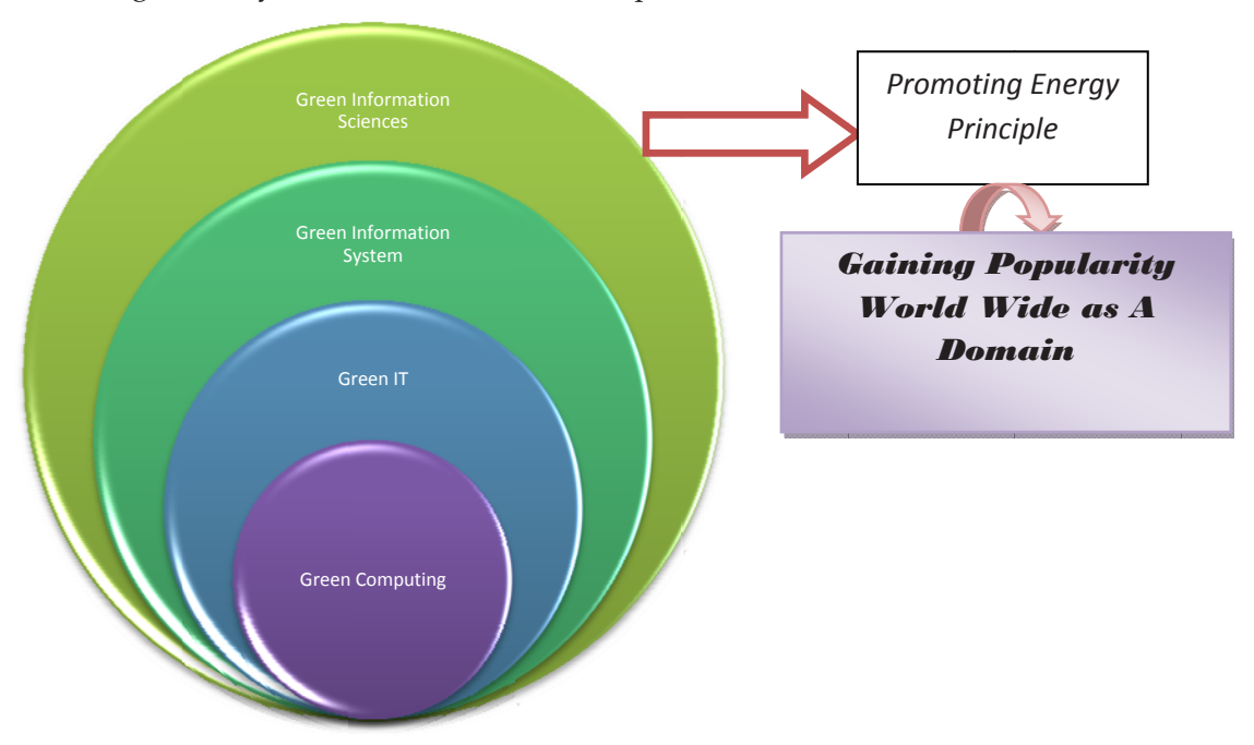
Fig. 3: Showing Green Computing and related field and its potentiality as academic field