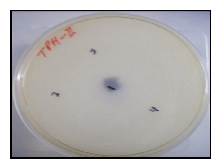
Fig. 1: Biogenic amines production test on Tyrosine Medium (TPM)

All the 40 strains of L. reuteri were initially screened for amino acid decarboxylase activity towards two amino acids viz. tyrosine and histidine using improved medium (Bover-Cid and Holzapfel, 1999).