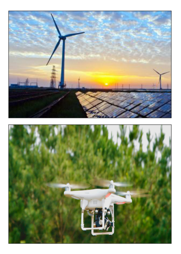
Fig. 1: Depicted various concerns of AI applications in Environment and Ecology

Every day the planet become warm and climates are also changing; according to a report in the year 2016 there was 772 weather and disaster related event and the number was increased three times what happened in the year 1980 in this regard. Due to this activity around 20 % of the species currently are facing problems and it may reach around 50% in the year 2100 according to the experts. Moreover, the temperature of the earth can also rise to 3°C higher than in pre-industrial times. Here Artificial Intelligence and similar Computing system are worthy to manage the climate change and also to protect the planet. As Artificial Intelligence is worthy and can sense their environment, think, learn, and act based on need. Such practices also noted, examined and practiced different parts of the globe including in India, Norway, China, etc. Here Cloud Computing is also worthy to store the data of each and every important moment and context and also in respect of communication and networking among the weather and climate management stations.