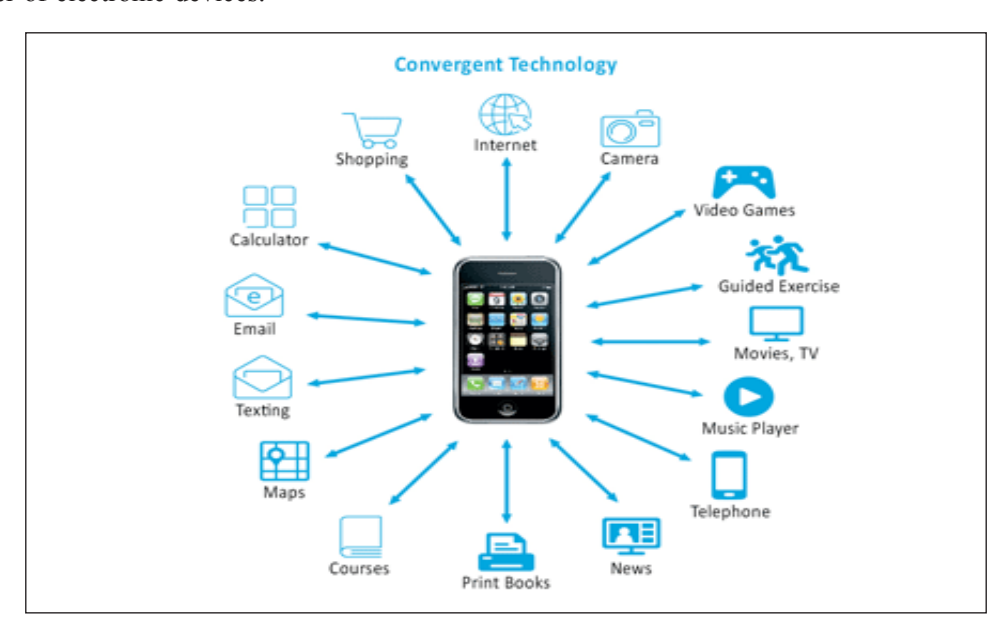
Fig. 3: Convergence in Smart Phone [V]

A good way to evaluate the important of convergence technological tools is to consider innovation from previous generations. Now a current day many technological tools used in the world. So, among them, Smartphone's are one of the best technological tools. Smart Phones now are integration of lot number of electronic devices.