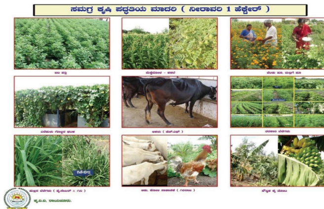
Fig. 2: A view of components integrated farming system module