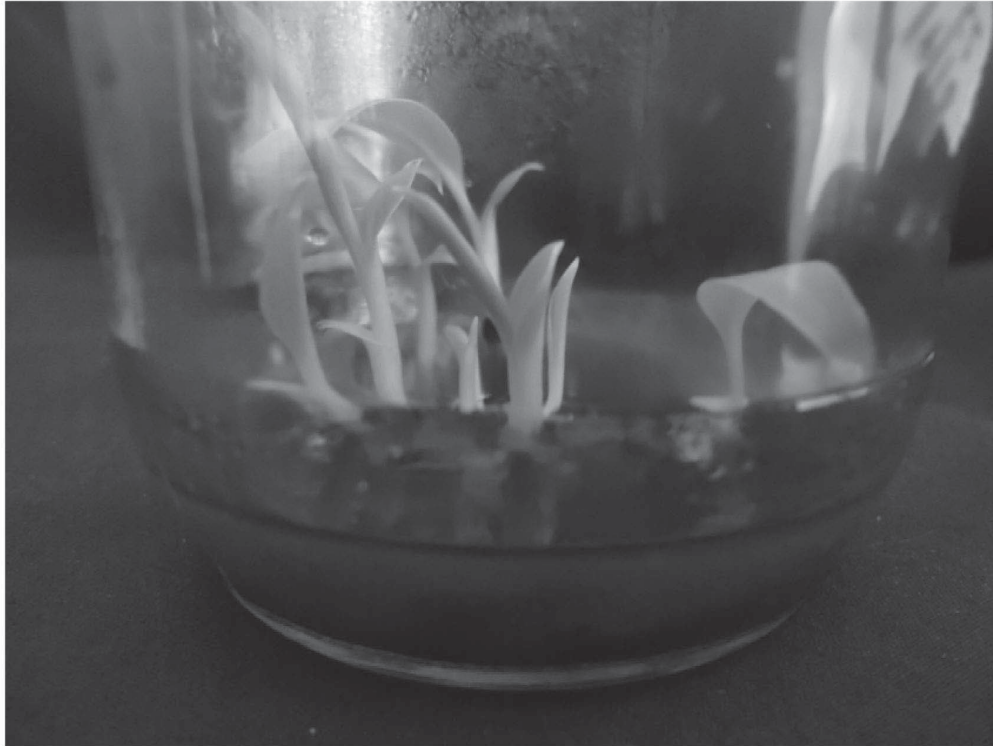
Fig. 4: Multiple shoot formation in MU medium supplemented with 3 mg/l KIN and 10 mg/l Phloroglucinol after 20 days of inoculation