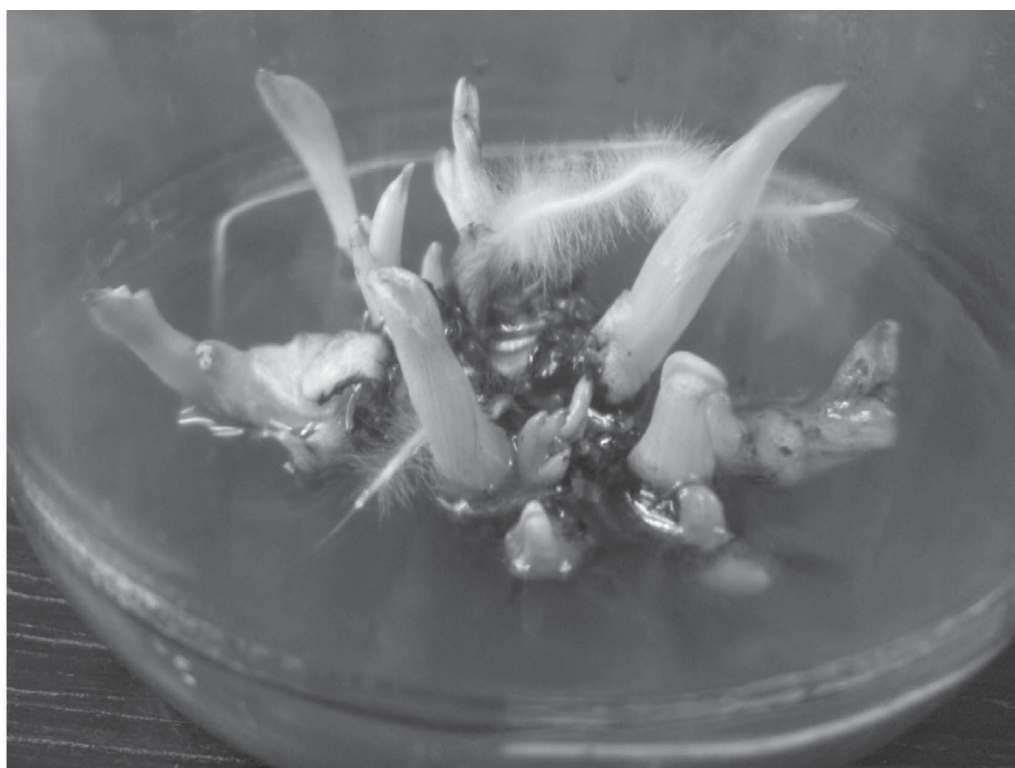
Fig. 3: Multiple shoot formation in MU medium supplemented with 3 mg/l BAP