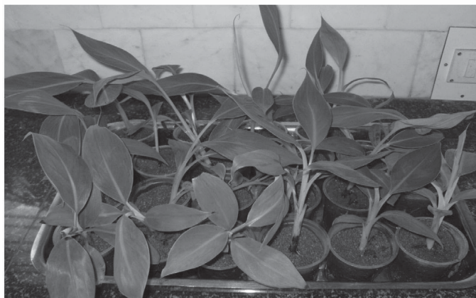
Fig. 7: Hardened plants

Percent root induction was found to be greater from explants cultured on MU medium alone (81.7±1.7%) than in combination with either IAA or NAA or 2,4-D (1.5 mg l -1 ). MU medium without any supplementation with PGRs also produced the maximum number (22.7±4.4) of roots per Explant. The plants were hardened using sterile sand and top soil in the ratio 2: 1