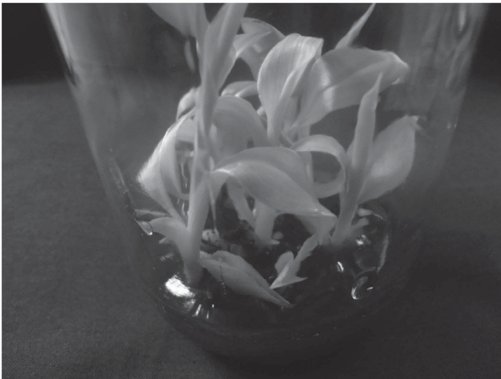
Fig. 5: Healthy plant lets formed from multiple shoot initials