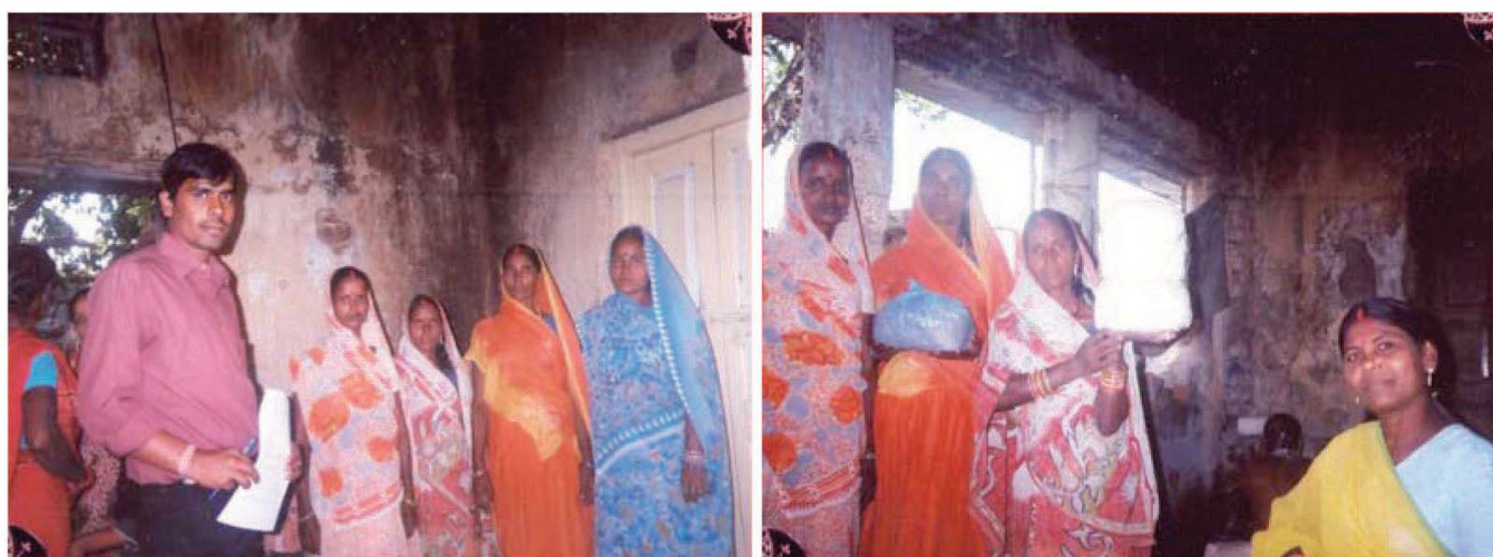
Plate 3: Members of Poonam Mahila Mandal showing paddy straw mushroom

Intervention and process: The Farmers Advisory Committee of Barh block discussed this problem in ATMA management committee meeting. Keeping in view the very small size of land holding in the village and the importance of mushroom cultivation as a subsidiary enterprise as well as its nutrition aspects, it was decided to introduce improved methods of mushroom cultivation in Budhnichak village to provide a source of gainful employment to the needy. The Project Director visited this village and contacted women farmers who were equally interested to take this new venture. So, twelve women farmers formed a self help group called Poonam Mahila Mandal in the year 2007 with the help of ATMA, Patna. They were provided training on mushroom cultivation technology by scientists from KVK, Agwanpur. After successful completion of the training programme, they were given spawn initially by KVK to start mushroom enterprise on their own.