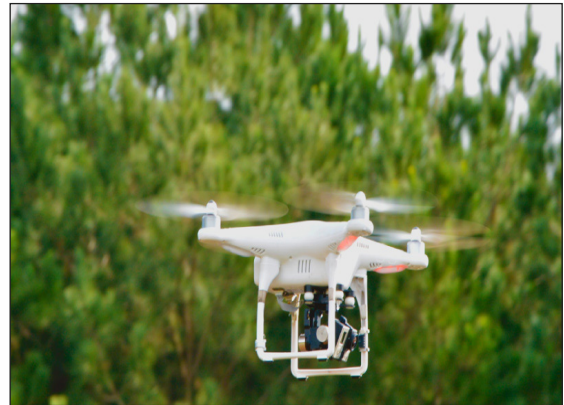
Fig. 1: Depicted various concerns of AI applications in Environment and Ecology

Every day the planet become warm and climates are also changing; according to a report in the year 2016 there was 772 weather and disaster related event and the number was increased three times what happened in the year 1980 in this regard. Due to this activity around 20 % of the species currently are facing problems and it may reach around 50% in the year 2100 according to the experts. Moreover, the temperature of the earth can also rise to 3°C higher than in pre-industrial times. Here Artificial Intelligence and similar Computing system are worthy to manage the climate change and also to protect the planet. As Artificial Intelligence is worthy and can sense their environment, think, learn, and act based on need. Such practices also noted, examined and practiced different parts of the globe including in India, Norway, China, etc. Here Cloud Computing is also worthy to store the data of each and every important moment and context and also in respect of communication and networking among the weather and climate management stations.