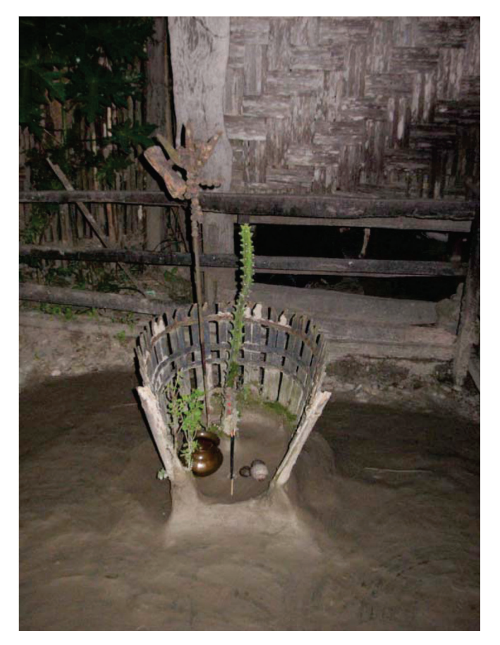
Fig. 2: Siju tree in the courtyard of a Mech hut in Jalpaiguri

Worship of sacred groves is also very common among the indigenous groups residing in this region. Banyan ( Ficus bengalensis ) and Pakur (Ficus lacor ) trees are worshipped by the Rajbangshis, Meches, Ravas, and Oraons. The Rajbanshis perform a marriage ceremony between the Banyan and Pakur tree. Both of them are big trees with various medicinal properties(see Table 1). Different parts of the banyan tree is used for the treatment of tooth ache and male sterility. The bark of the tree is useful for treating menstrual disorder (Bhattacharya, 1979: 55). The Meches worship another big tree called Asvatha (Fiscus religiosa) . This tree is used extensively in Ayurvedic medicine (Bhattacharya, 1979: 57-62). It is used for the treatment of burn, infection in vagina and wound inside a child's mouth. The Meches also worship Siju tree ( Euphorbia royleana ) as Siva . Almost every Mech house in the district has this tree in the courtyard (Fig.2). The leaves of this tree are useful in the treatment of skin infection (Rai,2004). Siva is usually represented by