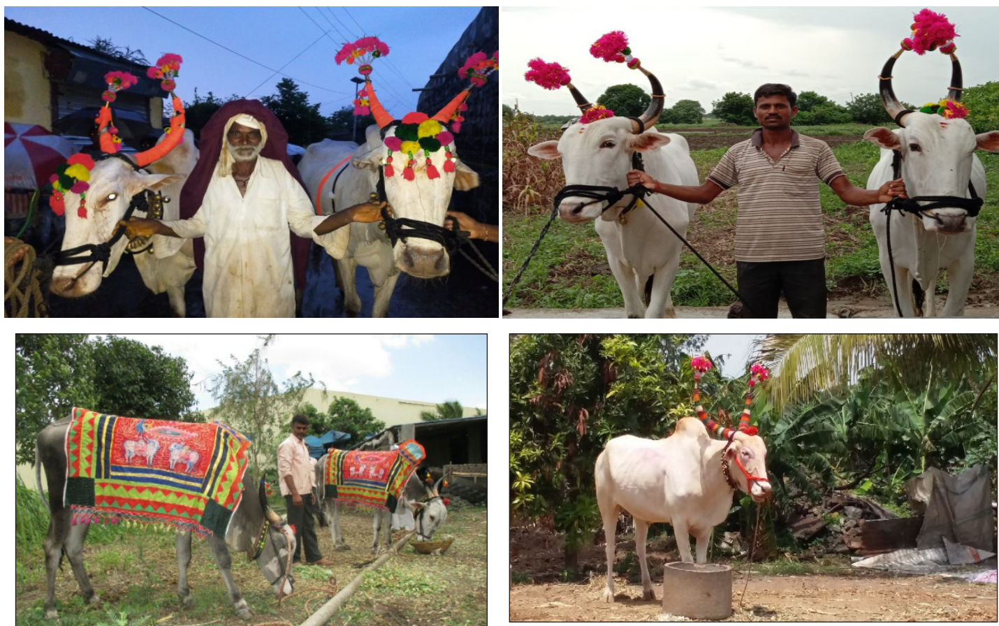
Fig. 2, 3 & 4: Decoration of bullocks without using chemical colour or painting their horns

with a coloured soft cloth etc. and all these won't cause any harm to animals. Bullock owners whole heartedly agreed for these options and not to use chemical colour, paints and horn shearing during the Bail Pola festival in future.