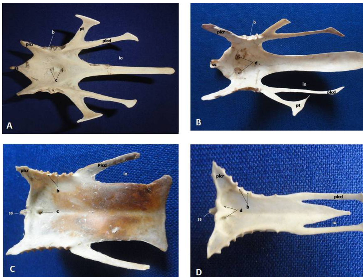
Fig. 2: Dorsal view of sternum of peacock (A), turkey (B), duck (C) and white-breasted waterhen showing crista sterni (cs), processus lateralis cranialis (plcr), processus lateralis caudalis (plcd), processus thoracicus (pt), foramen ovale (io), facet for articulation with rib (b), foramen pneumaticum medianum (c), foramen pneumaticum (d).

slightly away from the cranial border of the sternum (Fig. 1D). In duck, the anterior border of the crest was slightly concave which is in contrast to the observation of Nickel et al. (1977) who described it straight in duck and goose. The sharp cranial end of the crest extended slightly forward to the cranial end of the sternum.