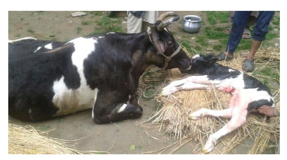
Fig. 1: showing the cow with live male calf after the torsion was relieved

long and 9 inches wide were tied one upon another and were used to immobilize the uterus while rolling the cow. Mustard oil was used to manage the friction between the plank and the animal's skin. Vaginal examination was performed after each roll to access the degree of detorsion. After two complete rolls fetal fluids started flowing out at the vulva and the vaginal examination revealed complete dilation of cervix. The fetus was observed in posterior longitudinal presentation, dorso-ilial position, with hind legs extended in the birth canal. The fetus was maneuvered into dorso-sacral position and a live male calf was delivered after applying some traction (Fig. 1). The placenta was expelled along with the fetus. Four boluses of intrauterine antibiotic were placed inside the uterus of the cow. Further, the animal was administered intravenously a pint of Calcium Borogluconate and two pints of DNS, besides injections of Melonex (20 ml IV for 3 days), Tribivet (10 ml IV for 3 days) and antihistamines. Also liquid Exapar (100 ml orally for 5 days) was prescribed for enhancing evacuation of uterine exudates and to aid uterine involution. The cow got up by herself within 15 minutes after the calf was delivered. Eventually, the cow recovered uneventfully.