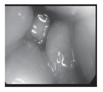
Fig 1: Hysteroscopic picture of a estrus buffalo uterus showing uterine wall folding and mucus

In 45.0% of the genitalia from buffaloes the ovaries evidenced the presence of small follicles, but no CL or mature follicles were evident. Endoscopic examination of these uteri revealed no specific findings but in I (5%) uterus hemorrhages over the musculature of the uterine wall were observed (Fig. 2 and Fig 3) without other specific change.