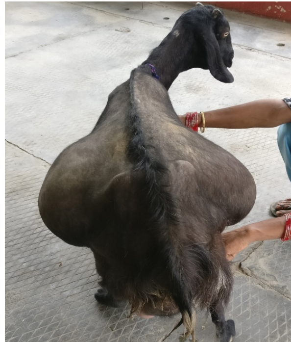
Fig. 3: Animal no. 4 presented to VGO polyclinic with severe abdominal distension