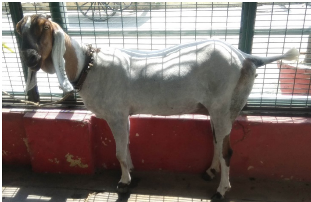
Fig. 1: Animal no. 1 presented to VGO polyclinic

of uterine contents with USG found as a promising technique in differentiating various degree of hydrometra in goats while Barna et al. (2017) found double injection of PGF 2 α at 11 days interval as successful treatment of hydrometra followed by 64% subsequent pregnancy rate. Hydrosalpinx had also been reported concomitantly with hydrometra, which may be a cause of fetal loss after and failure of implantation leading to accumulation of fluid in the uterus (Strandell, 2000; Margalioth et al. 2006; Maia et al. 2018). Almubarak et al. (2016); Farliana and Yimer (2016) and Balamurugan et al. (2018) also diagnosed hydrometra in a goat via USG with subsequent use of single injection of cloprostenol sodium for evacuation of uterine contents and returning of the goat to estrus 36 h following the therapy.