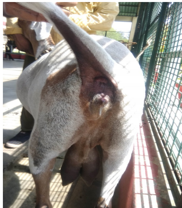
Fig. 4: Animal no. 1 presented to VGO polyclinic with mucoid vaginal discharge after treatment