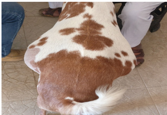
Fig. 2: Animal no. 3 presented to VGO polyclinic with moderate abdominal distension