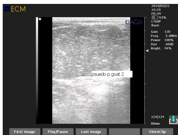
Fig. 6: Per rectal ultrasonographic image of animal 1 with hydrometra