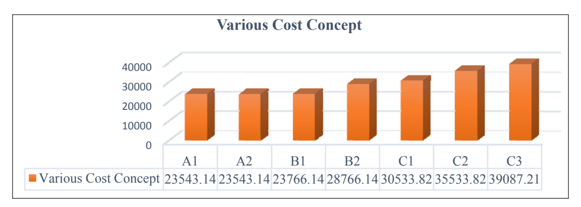
Fig. 1: Per acre various cost concepts used in Tomato Cultivation in Kandi Block