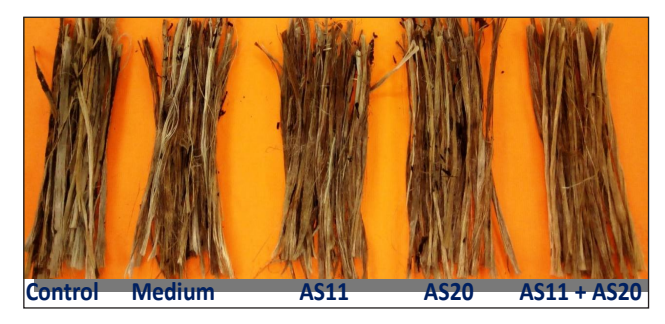
Fig. 1: Photograph of treated and non-treated barky root cuttings with bacterial consortium after 10 days

It was observed in table 1 that 87% reduction in barky roots was achieved with the treatment with a bacterial consortium consisting of AS11 and AS20 in 10 days (Table 1; Fig. 1) as compared to other treatments (Table 2).