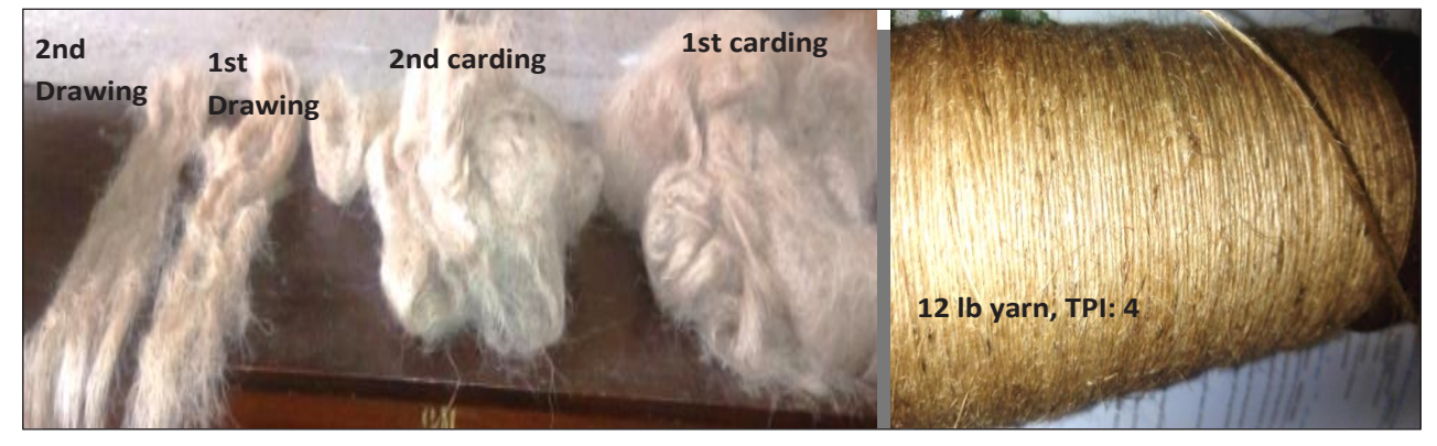
Fig. 3: TPI: 4; Count: 12 lbs/spy; Gauge length = 500 mm; Speed = 300 mm/min