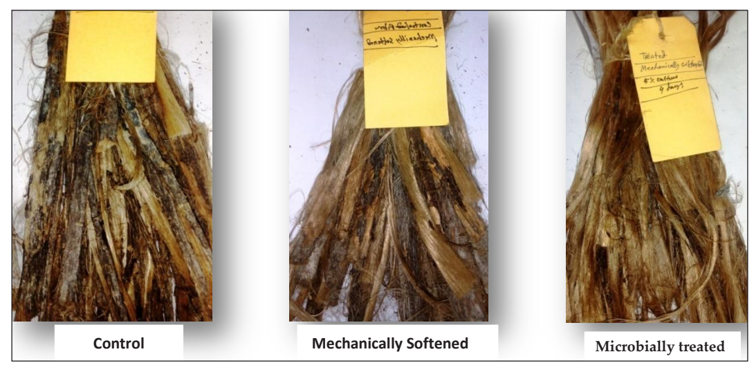
Fig. 4: Treated and untreated fibres with the formulations

mixing/batching with TD-4 grade jute fibre with a 50:50 ratio which enhanced quality ratio from 46.6 (100% treated fibre) to 68.9 (50:50 ratio) (Table 6 & 7, Fig. 4 & 5).