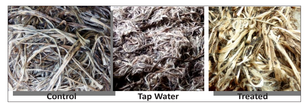
Fig. 2: Photographs of the control and treated barky root cuttings

An up-scaling of the treatment was carried out with 25 kg root cuttings. Here bacterial consortium was reduced and liquor ratio was increased to 1:15 with the same objective to increase spinnability keeping