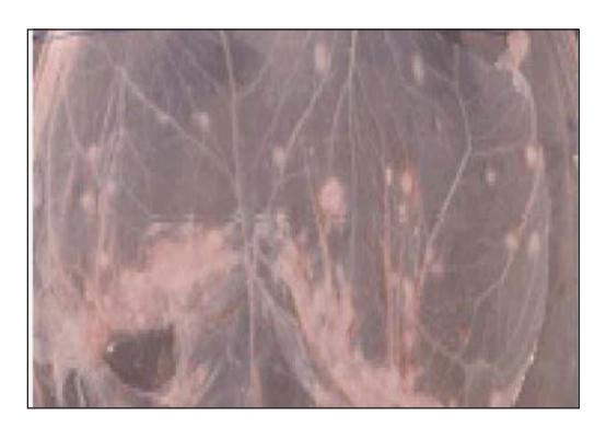
Fig. 2: Pock lesion of LSDV on CAM scattered white foci. numerous, small

Note: +++ = recommended method; ++ = suitable method; + = may be used in some situations, but cost, reliability, or other factors severely limits its application; -=not appropriate for this purpose. PCR=polymerase chain reaction; VN=virus neutralization; IFAT=indirect fluorescent antibody test, adapted from OIE.