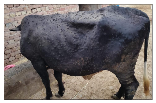
Fig. 1: Characteristic LSD nodular lesion indicating severity: Lesion covering the whole body in severe form

For naturally occurring cases, the incubation time for LSD is 2 to 5 weeks, however for artificially infected calves, it is 1 to 2 weeks. LSD has two different classifications: moderate and severe. The number of lumps (nodules), the dosage of the inoculum, the host's susceptibility, and the density of the insect population are used to classify it. It is characterised by fever, increased nasal discharge, watery eyes, and skin nodules that can be seen on the head, neck, udder, rump, perineum, and leg area (Pandeya et al. 2021).