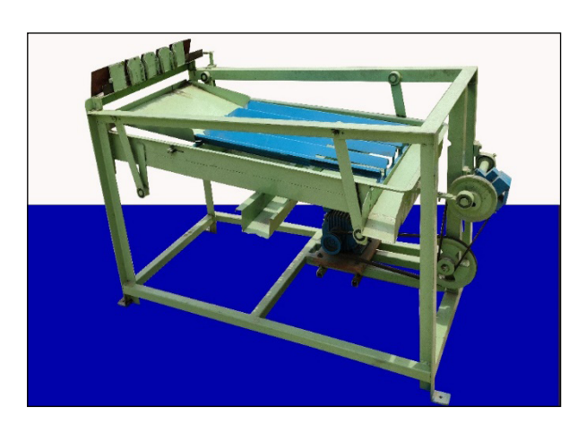
Fig. 2: Developed garlic stalk cutter cum grader machine

Based on necessary assumptions made, the total fixed and variable annual cost for the operating machine was calculated as ₹ 7722 and ₹ 56370.84 respectively. The total annual cost of operating the machine including electricity charges was ₹ 64191.84. The productivity of the machine per year was calculated 852.48 q which was very high compared to manual operations. The cutting and grading cost of the machine and manual labour resulted in ₹ 75.3/q and ₹ 594.6/q, respectively. It was observed that the machine operator has a profit of ₹ 519 per quintal of garlic detopped and graded which can result in an annual profit of ₹ 442910.7 if the machine is operated all the annual working