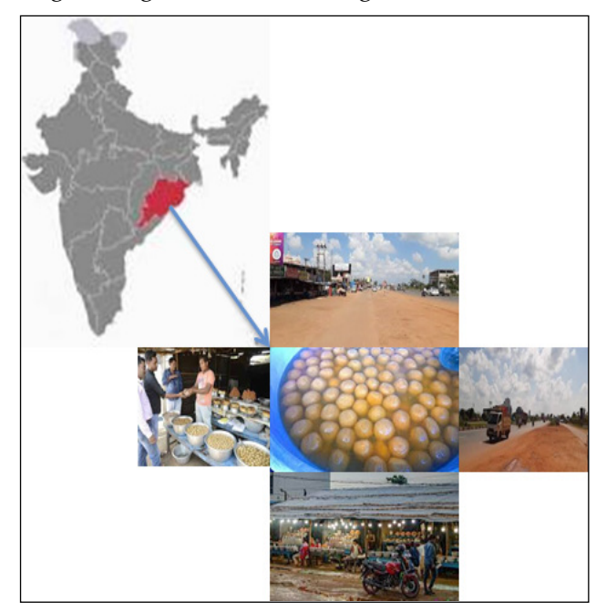
Fig. 2 highlighted, the supply chain of Rasagola in the study area was extended from the core supplier level of Niali Block of Cuttack district of Odisha to consumers seating at Sambalpur, Rourkela, and Rayagada district of the state and sometimes to the neighboring state of West Bengal.