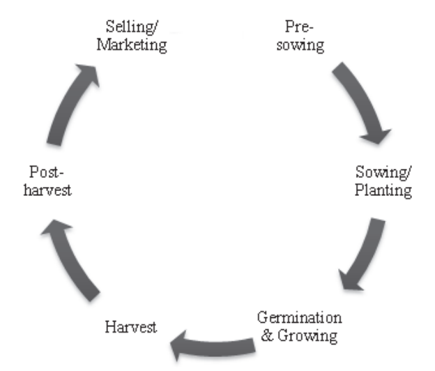
Figure 1: Education and information requirements at various stages of agricultural cycle

departments including agricultural universities and Non Government Organizations (NGOs). However, gaps still existed between the science generated in research institutions and common farmer practices (Mancini et al., 2007). The UN Food and Agriculture Organization (FAO) designed Farmer Field Schools (FFS) which was launched in India in 1999 is a non-formal and unique way to educate/ train farmers and is an effective platform for sharing of experiences and collectively solving agriculture related problems. Generally, weekly or fortnightly training sessions are conducted in the villages for a group of 20–30 farmers by expert facilitators during the cropping seasons.