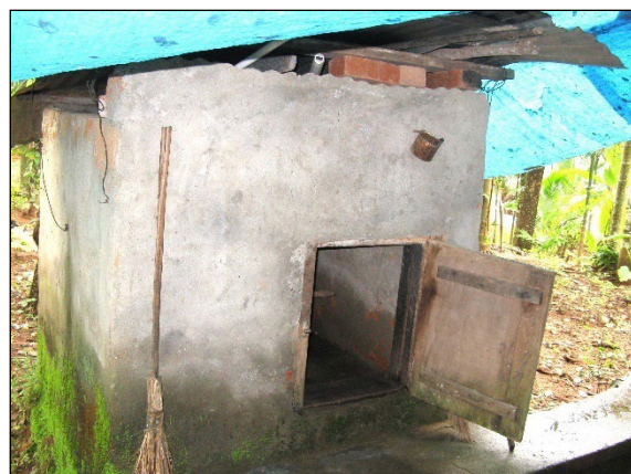
(h) Brick with cement and metal sheet roof