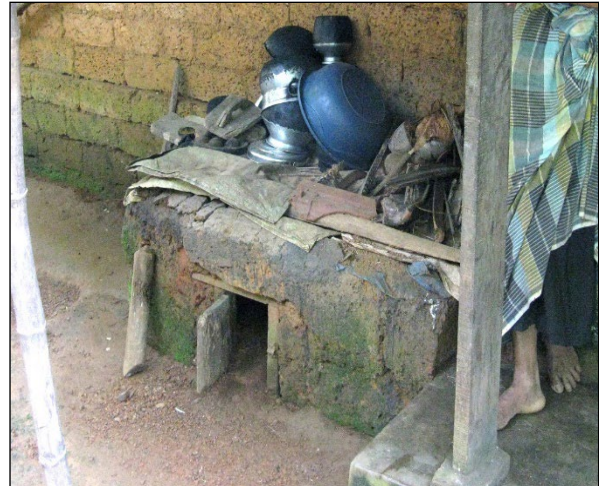
(b) Laterite brick and concrete roof (attached to house)