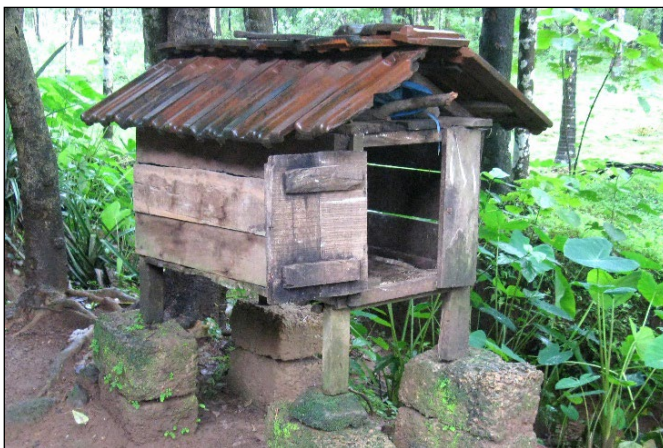
(e) Wood and tiled roof