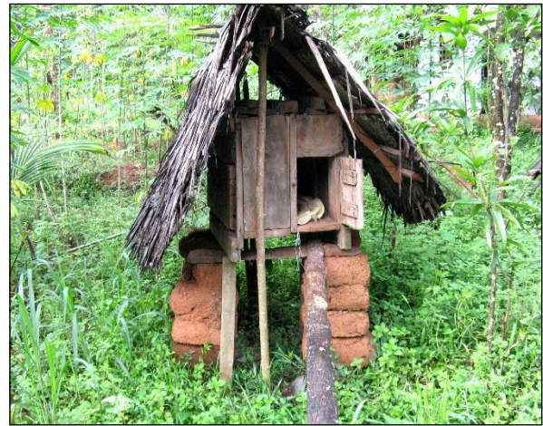
(d) Wood and thatched roof