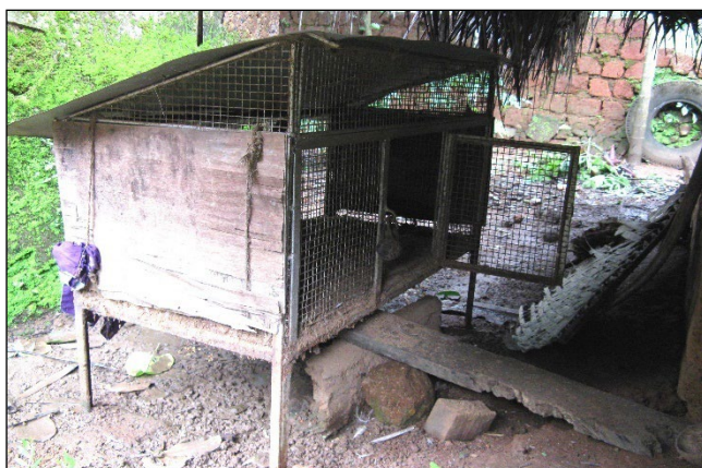
(g) Wood, weld mesh and metal sheet roof