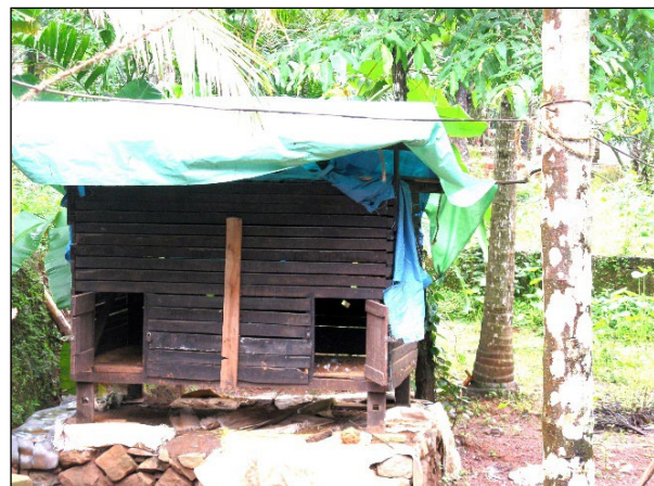
(f) Wood and metal + plastic sheet roof