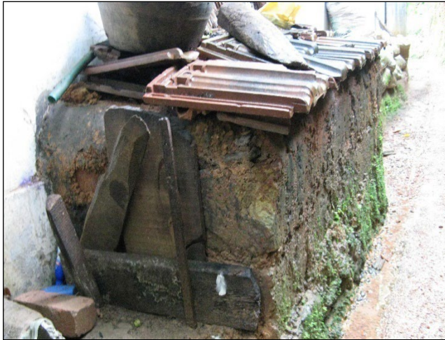
(a) Laterite brick and tiled roof (attached to house)